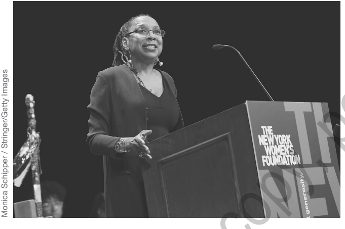
PHOTO 2.5 Legal scholar Kimberlé Crenshaw first coined the term intersectionality .

Feminists argue that attention to gender alone is not enough. Recall from Chapter 1 that intersectionality considers the meaning and consequences of multiple categories of identity, difference, and disadvantage simultaneously. Intersectionality is a concept that emerged and evolved largely within Black feminism and critical race theory (Collins, 2019; Else-Quest & Hyde, 2016; May, 2015). Kimberlé Crenshaw (1989, 1991), a legal scholar, first coined the term intersectionality and described how analyzing only gender or only race would exclude or ignore the unique experiences of women of color. Black