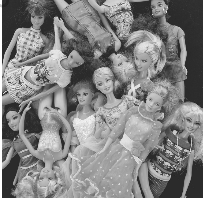
PHOTO 2.3 Genderschematic children recognize that these toys are created for girls.

order might be gorilla, butterfly, ant. If gender-typed people (masculine men and feminine women, as measured by the Bem Sex Role Inventory, a test discussed in Chapter 3) do possess a gender schema that they use to organize information, then they should cluster