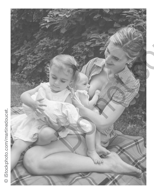
PHOTO 2.2 Learning gendered behavior: After the birth of a new sibling, this preschooler uses a doll to imitate her mother's breastfeeding.

Gender typing: The acquisition of gender-typed behaviors and learning of gender roles.