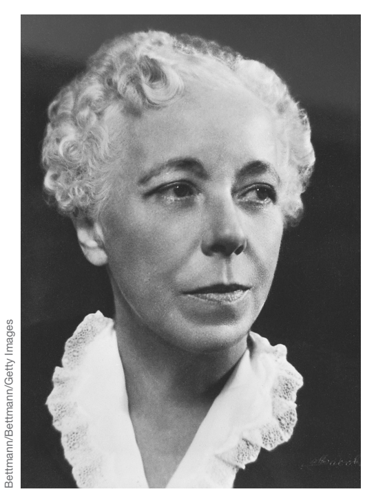
PHOTO 2.1 Karen Horney made substantial contributions to psychoanalytic theory.

Womb envy: In Horney's analytic theory, the man's envy of the woman's uterus and reproductive capacity.