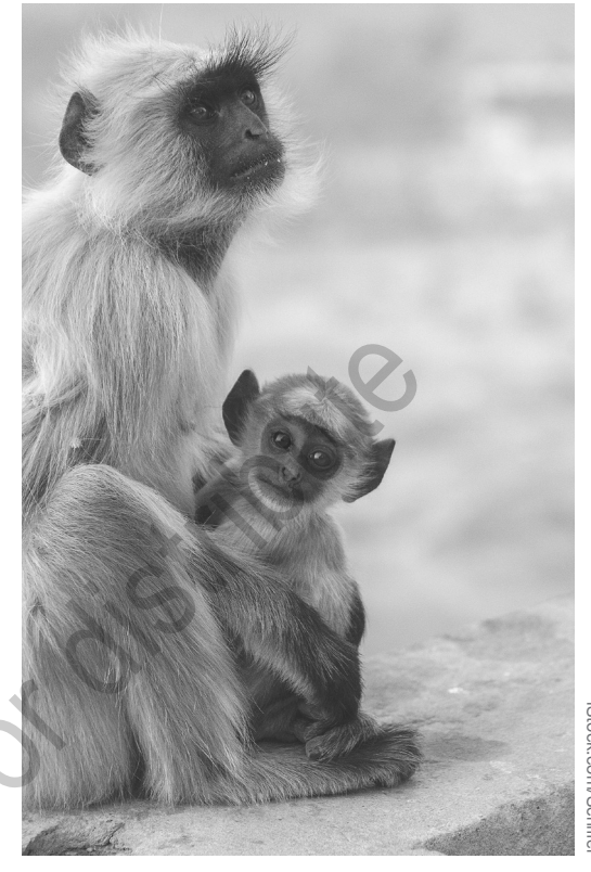
PHOTO 2.4 Feminist sociobiologist Sarah Blaffer Hrdy studies maternal behaviors among primates, such as these langurs.

Hrdy's basic argument is that women have evolved to care for their children and ensure their survival, but in reality these evolved tendencies are miles away from romanticized Victorian notions of all-loving, self-sacrificing motherhood. Hrdy notes, for example, that female primates of all species combine work and family—that is, they must be ambitious, successful foragers or their babies will starve. Males are not the only ones who have status hierarchies; a female chimpanzee's status within her group has a powerful influence on whether her offspring survive and what the status of those offspring will be when they reach adulthood. In contrast to other sociobiologists' views of females as being highly selective about whom they mate with, Hrdy notes that female pri-