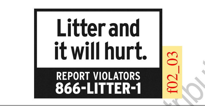
FIGURE 2.3 🔲 Road Sign for Reporting Littering