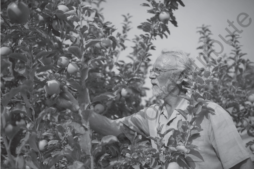
Rep. Dan Newhouse, R-Wash., picks apples on his farm, outside of Sunnyside, Washington.