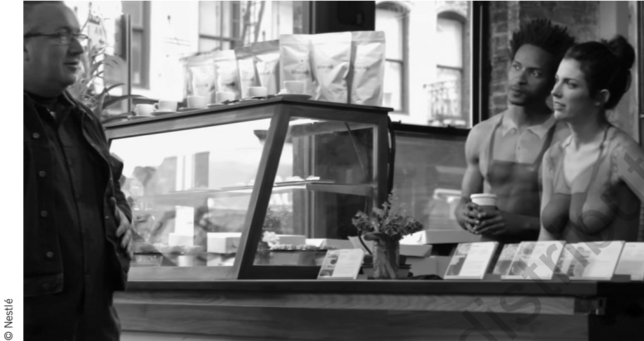
Nestlé emphasized the natural in its Natural Bliss Café coffee shop takeover.

managed by scantily clad, painted baristas. This strategy also relies in part on shared social media and traditional earned media to spread the story, ensuring coverage and awareness beyond those who entered the shop itself. In this way, smart strategies and tactics can impact multiple audiences through multiple channels.