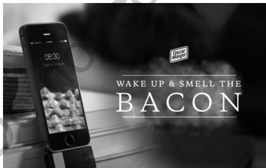
Photo 2.4 Smell the Bacon Campaign

Using the momentum gained from two very successful and imaginative 360i-led initiatives, “The Great American Bacon Barter” and “Say It with Bacon,” Oscar Mayer ensured its brand was up to the challenge of “bringing home the bacon” once again. By capitalizing on the popularity of bacon, the company targeted bacon lovers the world over; specifically directing their efforts toward consumers who were gadget and technology buffs and social media enthusiasts. Oscar Mayer decided to direct their efforts toward the creation of a revolutionary mobile alarm clock that would allowed bacon enthusiasts to wake up to the sound and scent of Oscar Mayer bacon. 26