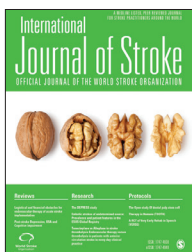
Interventional Journal of Stroke